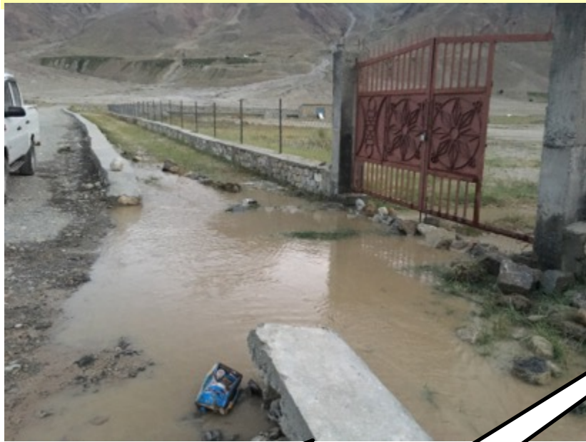
Main Campus Gate